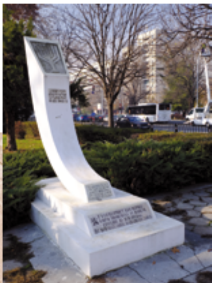
Monument dedicated to the rescue of the Jews of Plovdiv in the Dondukov Garden in Plovdiv

Plovdiv is known as a city of tolerance. Different religious communities have co - existed here for centuries. Today, in addition to Bulgarians, some Armenians, Jews, Turks, Roma, a few Czechs, Russians, Italians, Greeks and so on live in the city.