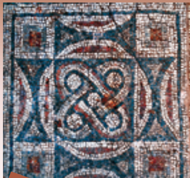
3 The Bishop's Basilica is the largest early Christian church in the Bulgarian lands.