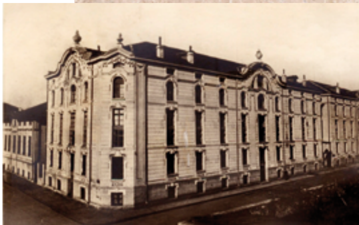
The warehouses of Kudoglu, Plovdiv, the Tobacco City, 1927

Mayor Bozhidar Zdravkov has special merits for the improvement of Plovdiv in the 1930s. He managed to implement a large-scale public works program which imposed the new look of Plovdiv.