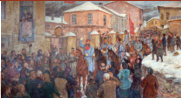
"Welcoming General Gurko in Plovdiv", artist Nyagul Stanchev

The Russo-Turkish War of Liberation began in 1877-1878. On January 4, 1878, Russian troops under the command of General Gurko liberated Plovdiv. On the following days, Suleiman Pasha's troops were finally defeated.