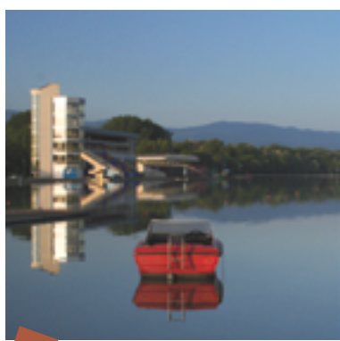
11 The largest Rowing Canal in the Balkans is situated here- a favorite place for relaxation and sport