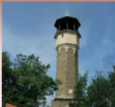
4 The clock tower of Sahat Tepe is one of the oldest in Europe – the 16 th century