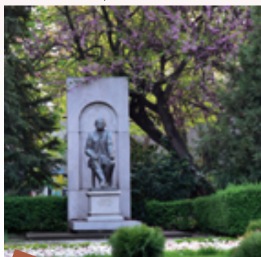
8 Dondukov Garden (1878) is the oldest park in the Bulgarian lands.