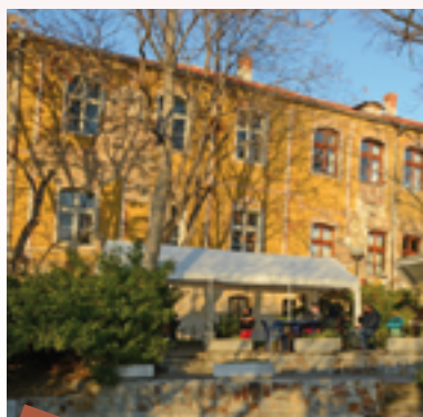
7 The first Bulgarian high school, Sts. Cyril and Methodius, was established in Plovdiv in 1868.