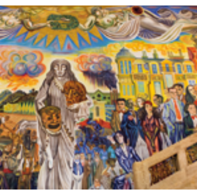
the first Bulgarian city with a troupe and a building from 1881 - a panel by John Leviev theater.