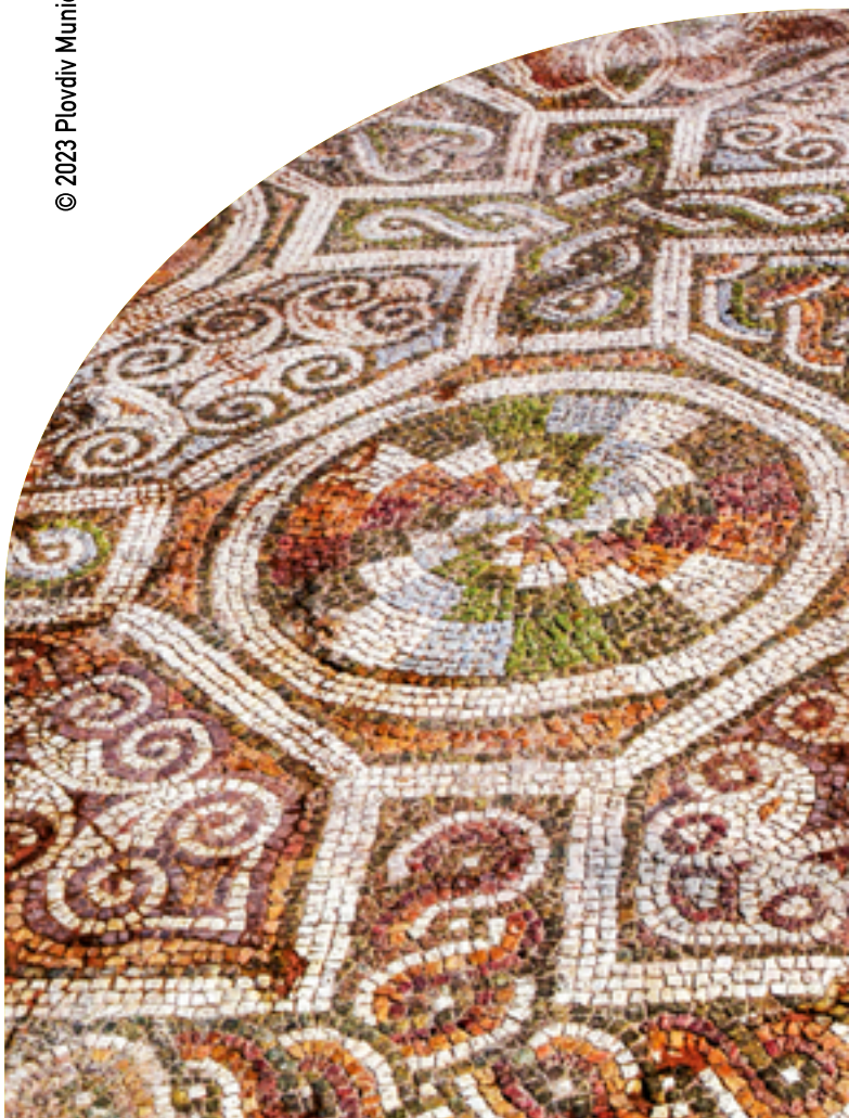
The Bishop's Basilica of Philippopolis (4 th - 6 th )C