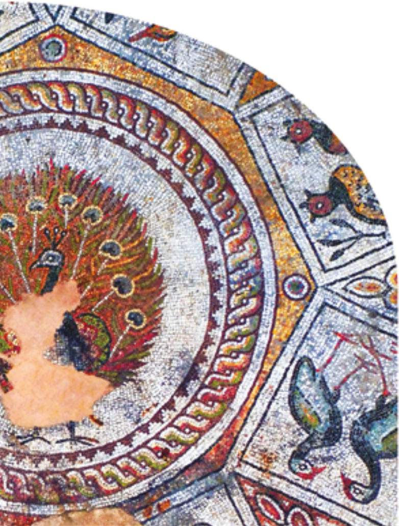
The Bishop's Basilica of Philippopolis (4 th -6 th C)